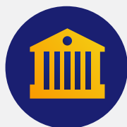
Figure 1: Digital Currency Settlement 7

USDC was selected based on our due diligence efforts, which included an examination of client demand, stability, and security. USDC measured up against all these criteria, with a robust developer community, growing adoption across clients, and a track record showing clear compliance and regulatory engagement.