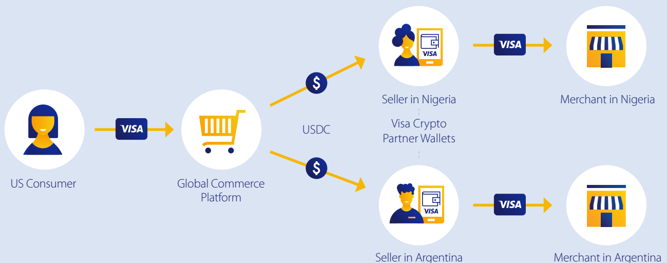
Figure 2: New Digital Currency Flow Payouts Use Case 8

These new digital currency payment flows can be particularly useful in instances where payers and payees are distributed globally, and in regions where payments in a US-backed currency are desirable. Additionally, they can complement the other ways Visa enables payment flows by enabling payouts over public blockchain networks that are received by digital currency wallets.